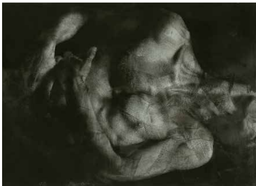
Detail of Reclining Figure 6 (2015) by Ahmad Zakii Anwar. It measures 76cm by 182cm and was exhibited at the Maritime Silk Road Art Festival 2015, Shanghai, China.

were created for The F Klub's inaugural exhibition, Seated , in 2013. Bayu's Sitting Waiting Still , dated 2012, measures 133cm by 163cm. Executed in charcoal on canvas, the work is estimated at between RM29,000 and RM35,000.