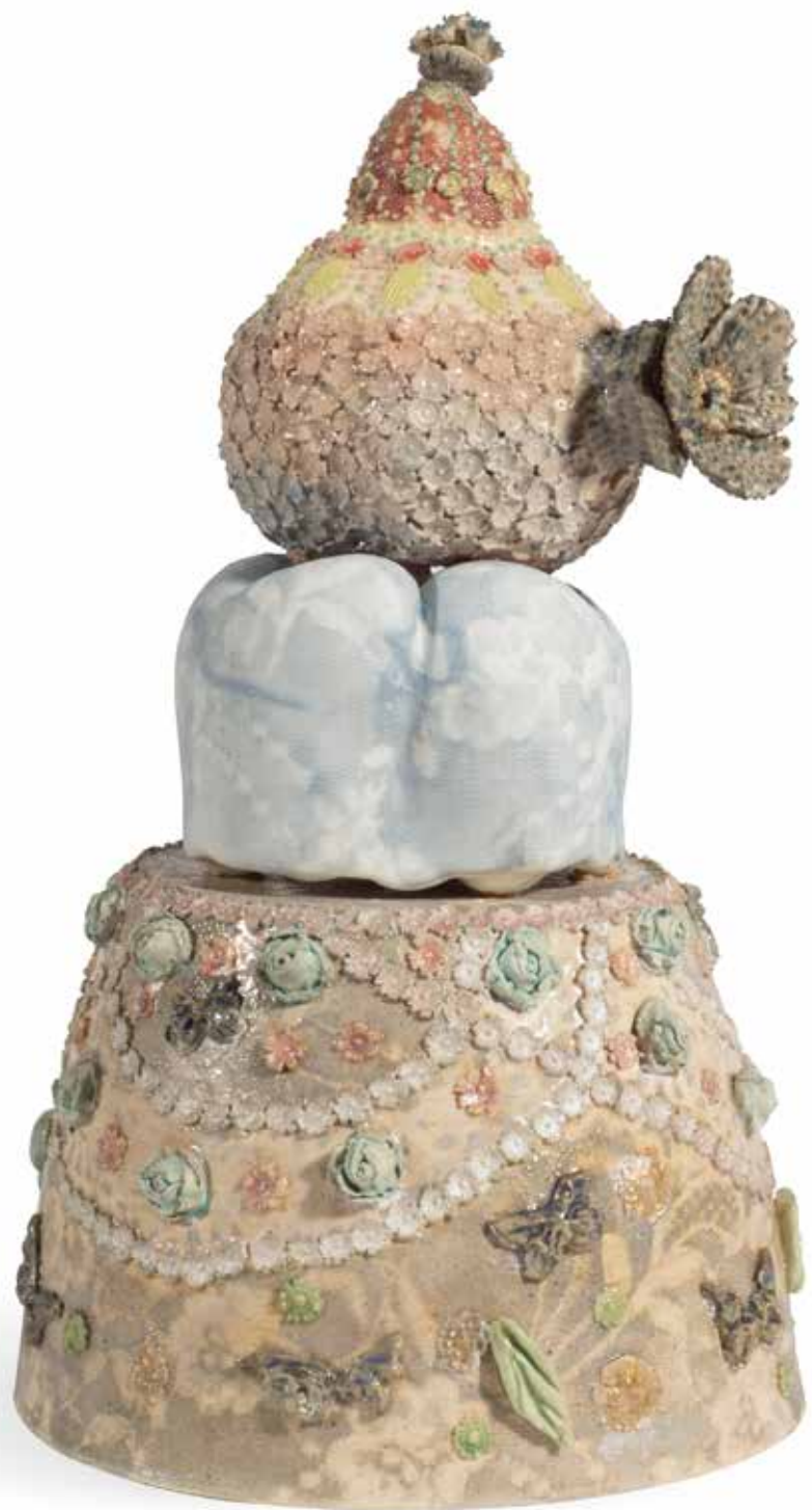
Sign #2 23 x 13 x 13 cm Ceramic 2016