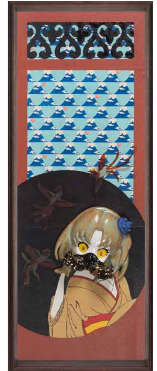
Semangat Timur #3

92 x 30.5 x 8 cm Ceramic, acrylic on canvas, collage glass & wooden box 2016