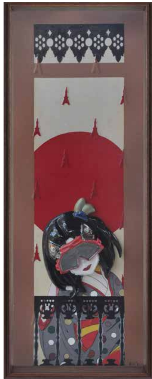
Semangat Timur #5 92 x 30.5 x 8 cm Ceramic, acrylic on canvas, collage glass & wooden box 2016