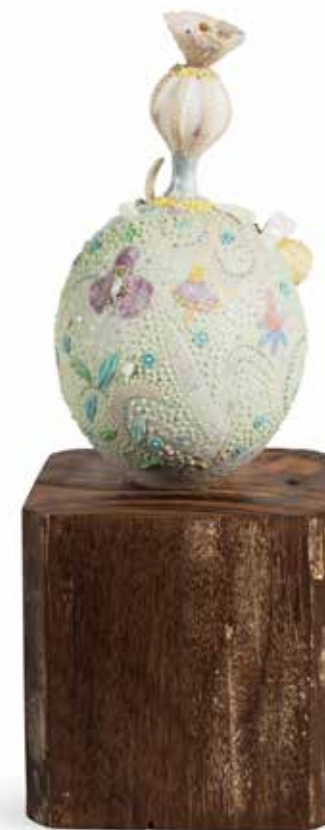
This is... #1 34 x 13 x 13 cm Ceramic & wood 2016