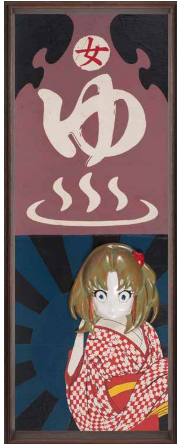
Semangat Timur #1

92 x 30.5 x 8 cm Ceramic, acrylic on canvas, collage glass & wooden box 2016