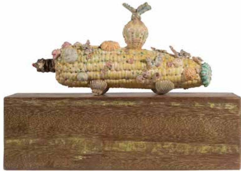
Drive 17 x 24 x 7 cm Ceramic & wood 2016