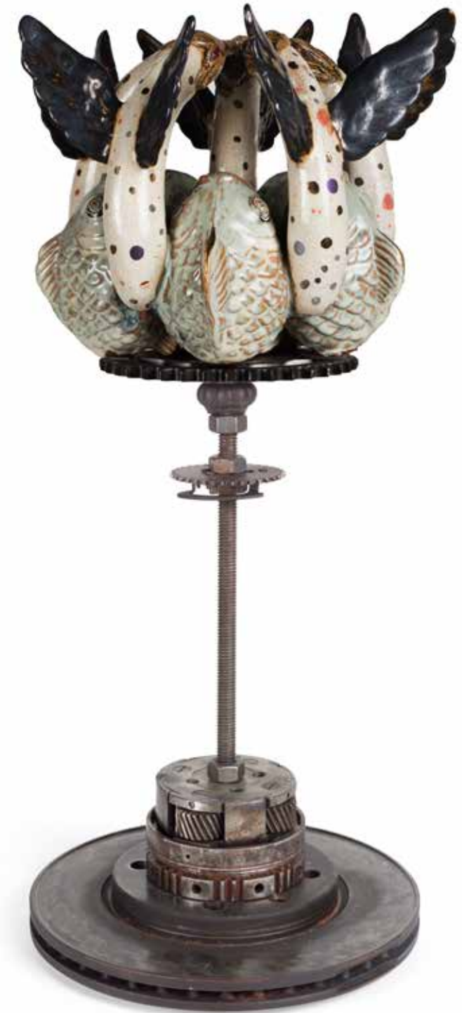
Camouflage 57 x 25 x 25 cm Ceramic & steel 2016