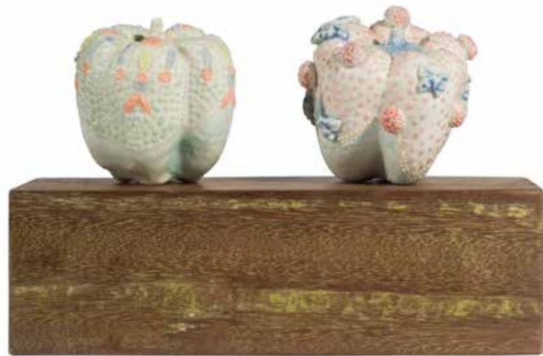
Haru-Haru 16 x 24 x 7 cm Ceramic & wood 2016