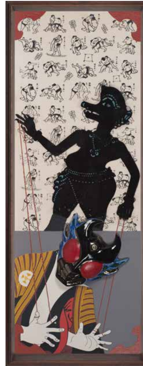
Semangat Timur #2

92 x 30.5 x 8 cm Ceramic, acrylic on canvas, collage glass & wooden box 2016