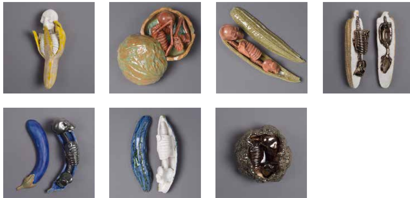
Parasite 26 x 26 x 10 cm (each) Ceramic, glass & box 2016