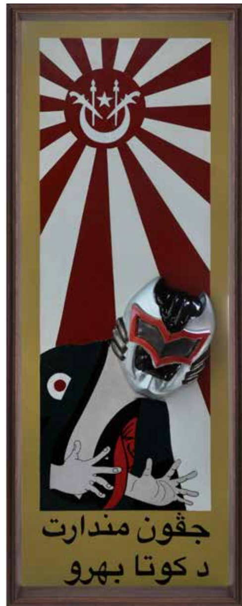
Semangat Timur #4 92 x 30.5 x 8 cm Ceramic, acrylic on canvas, collage glass & wooden box 2016