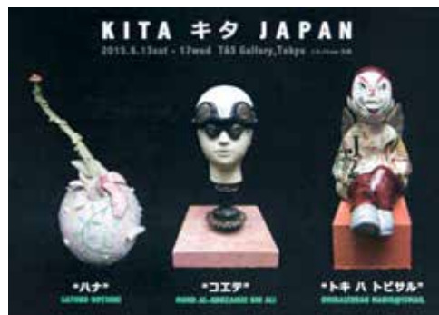
KITA KITA JAPAN, T&S Gallery, Tokyo, Japan. 2015.