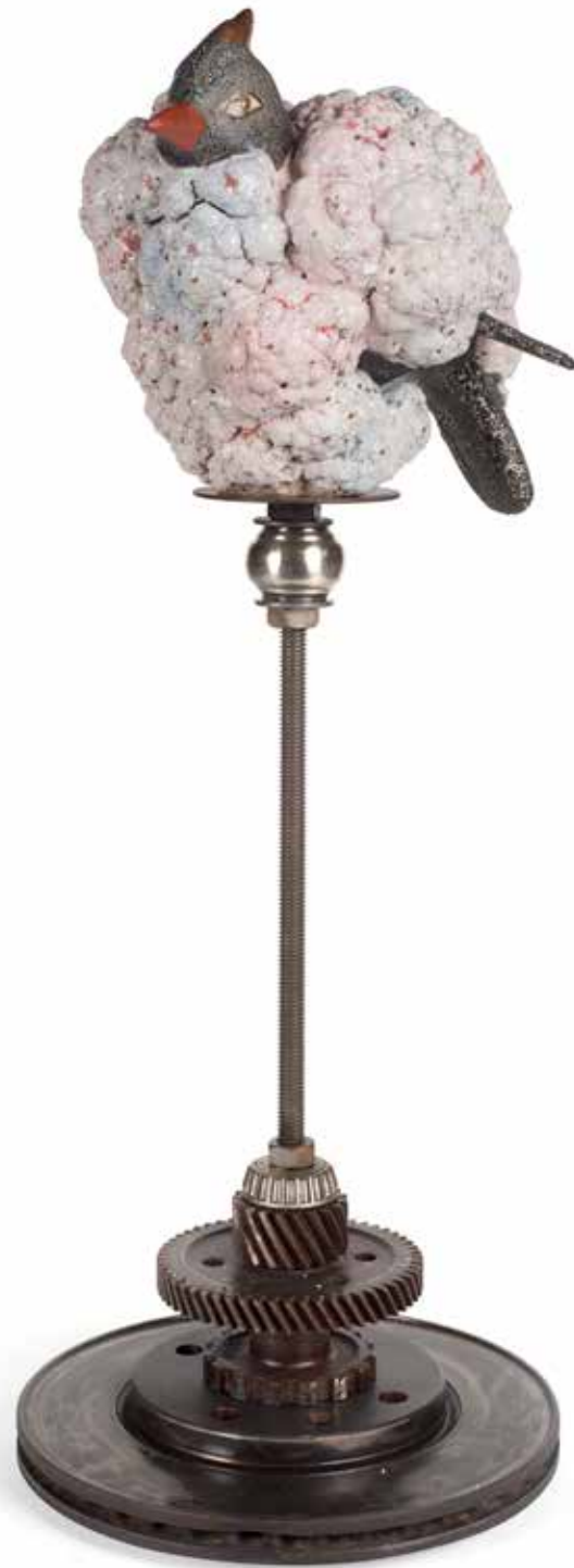
The Surrogate 63 x 25 x 25 cm Ceramic & steel 2016