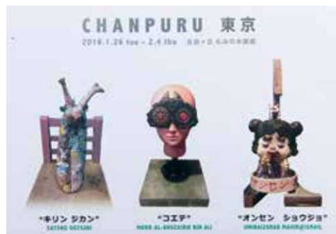
CHANPURU, Mominoki Gallery, Jiyugaoka, Tokyo, Japan. 2016.