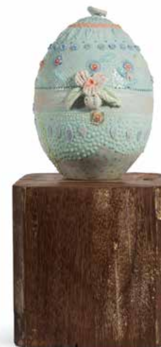
This is... #3 28 x 13 x 13 cm Ceramic & wood 2016