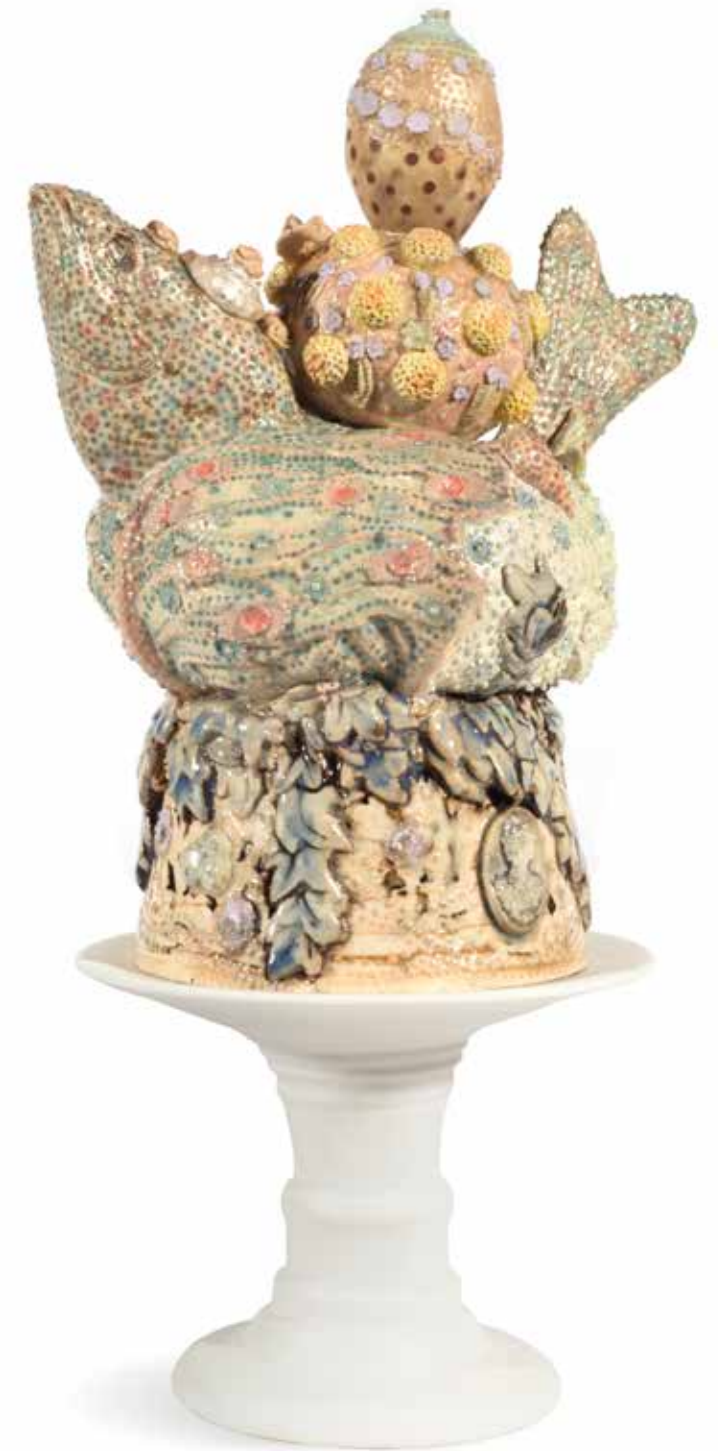
Someday 32 x 17 x 13 cm Ceramic 2016